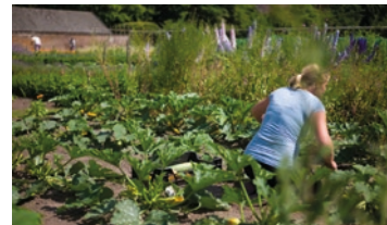
→ Kitchen Garden Vollenhoven

Wednesday evening, September 4 a meet and greet for early arriving participants (with drinks and small bites), including a guided tour through the historic kitchen garden of Vollenhoven country house in Bilthoven.