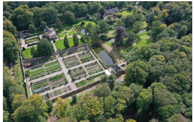
Kitchen garden at Culinary Estate Parc Broekhuizen | Aerial view of the kitchen garden of Zuylestein

You are kindly invited to join us at the second in person meeting of the European Symposium on the conservation of historic fruit and kitchen gardens on Thursday, September 5, 2024 at Culinary Estate Parc Broekhuizen in Leersum, The Netherlands. This is a centrally located country house in the province of Utrecht.