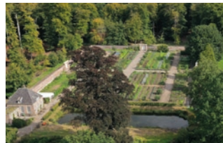
→ Historic Kitchen Garden Zuylestein