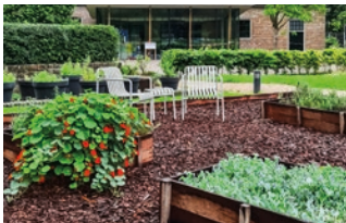
→ Parc Broekhuizen

An evening dinner is part of the program and is an excellent chance to network and to share experiences and knowledge with other participants.