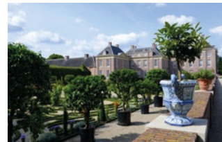
→ Loo Palace