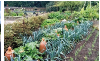
→ Twickel Estate