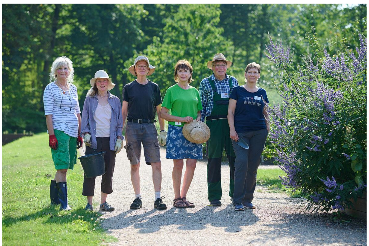
Volunteers at Eutin Castle