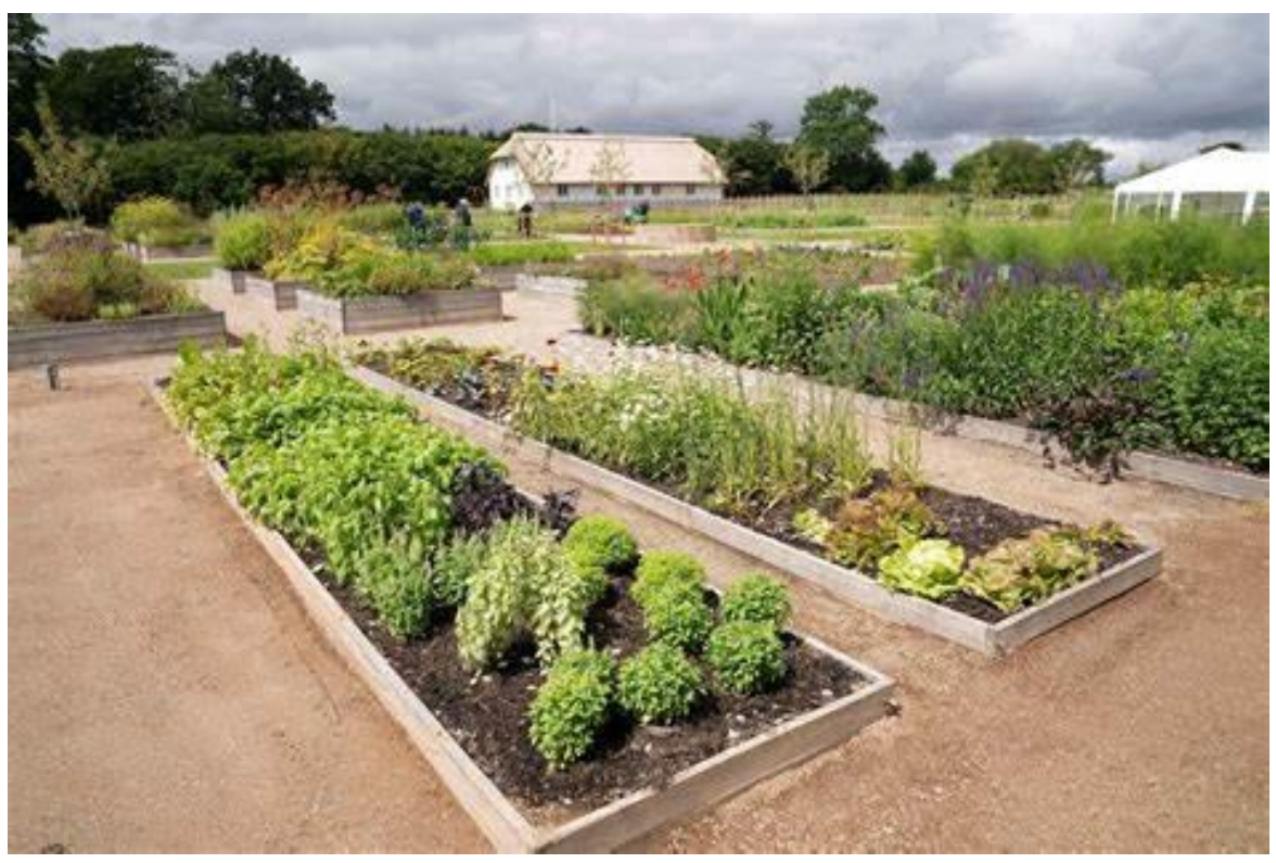
The Royal Kitchen Garden at Graasten Palace