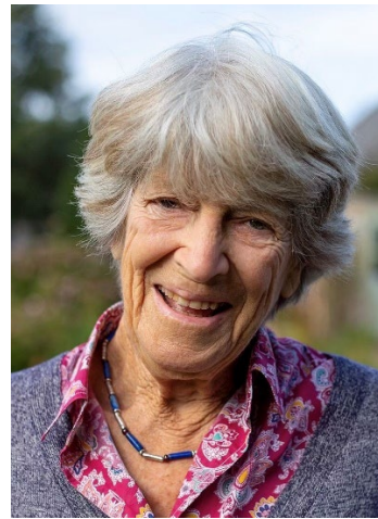
Susan Campbell's book finally translated into French