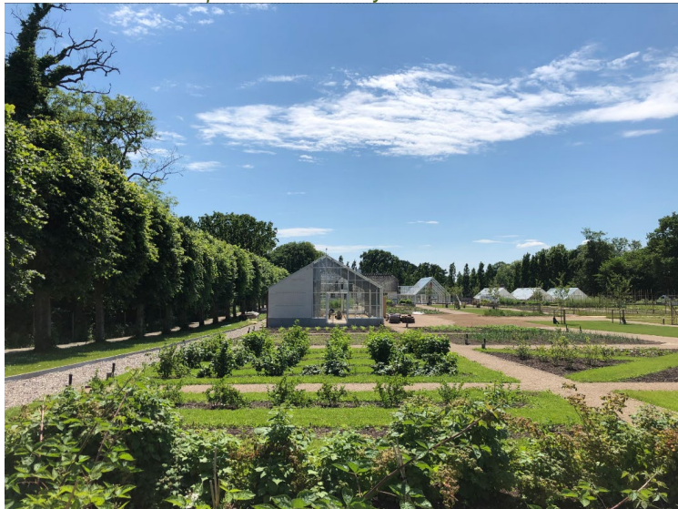
The Royal Kitchen Garden at Graasten Palace, Denmark © Slots- og Kulturstyrelsen

Two years after Chambord, and three months before we meet again at Culinary Estate Parc Broekhuizen in Leersum, the month of June 2024 will be special for the friends of the European Symposium on the conservation of fruit and kitchen gardens -