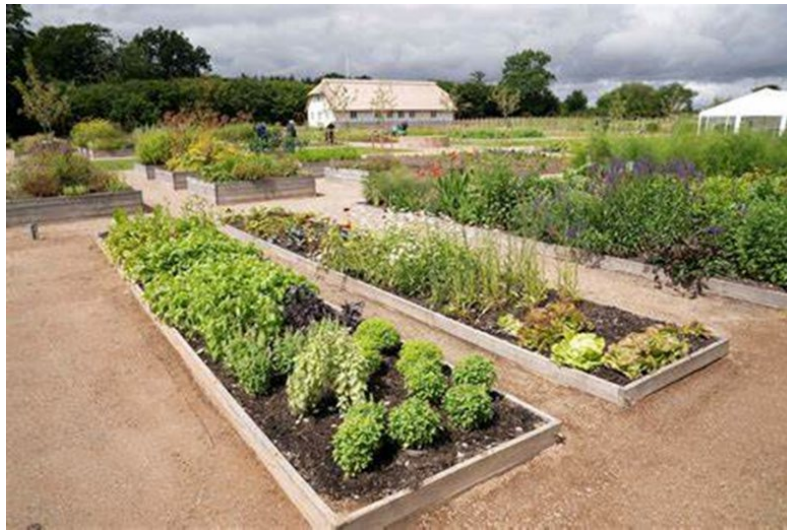
The Royal Kitchen Garden at Graasten Palace

learning about nature and the growing of food. Please register at amisdupotagerduroi@yahoo.fr to receive the link to this webinar.