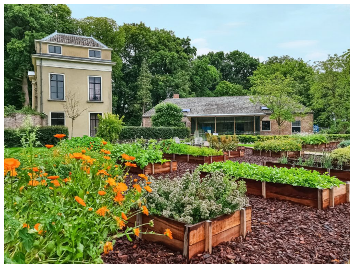
The kitchen garden at Culinary Estate Parc Broekhuizen.

For the full conference programme and the registration form go to: www.skbl.nl/the-second-european-symposium-on-the-conservation-of-historic-fruit-and-kitchen-gardens-en/