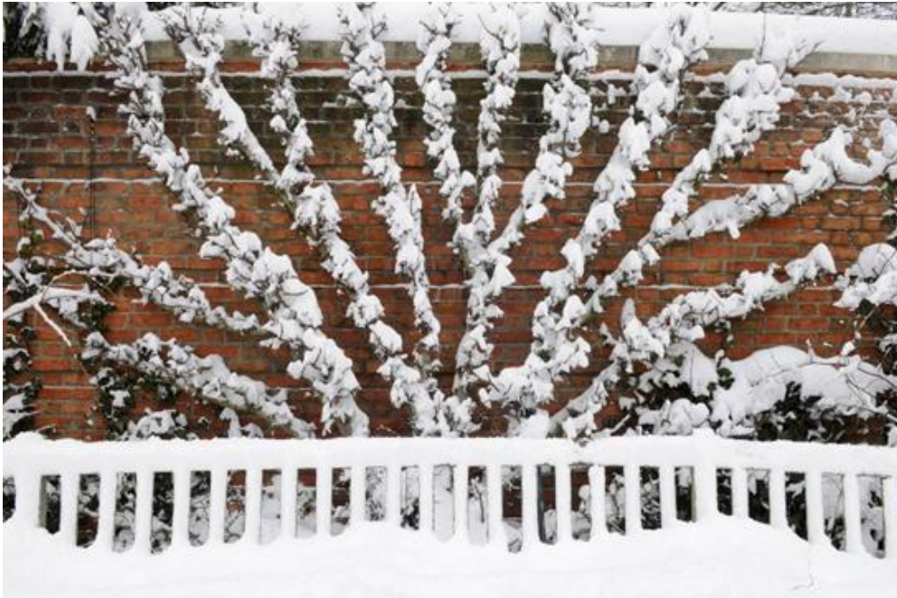
Espalier tree at Chicago Botanic Garden