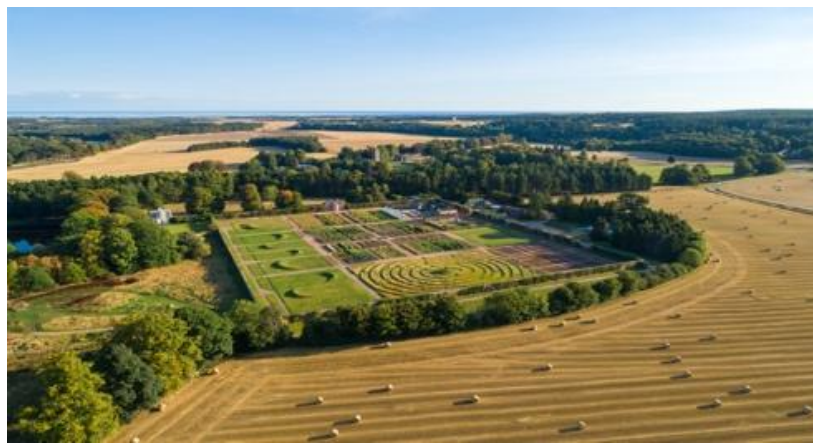
The Walled Garden at Gordon Castle

You receive this email because you participated in one of our (online) conferences. Our mailing address is: contact@potagershistoriqueshistorickitchengardens.eu Copyright © 2025 European symposium on the conservation of historic fruit and kitchen gardens. All rights reserved