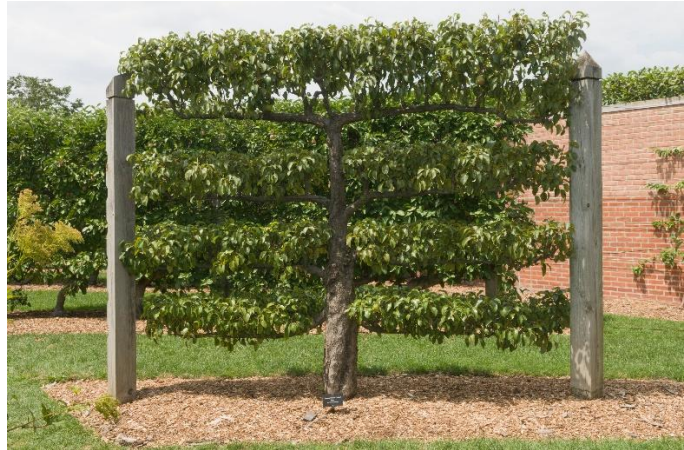
Espalier trees at Chicago Botanic Garden